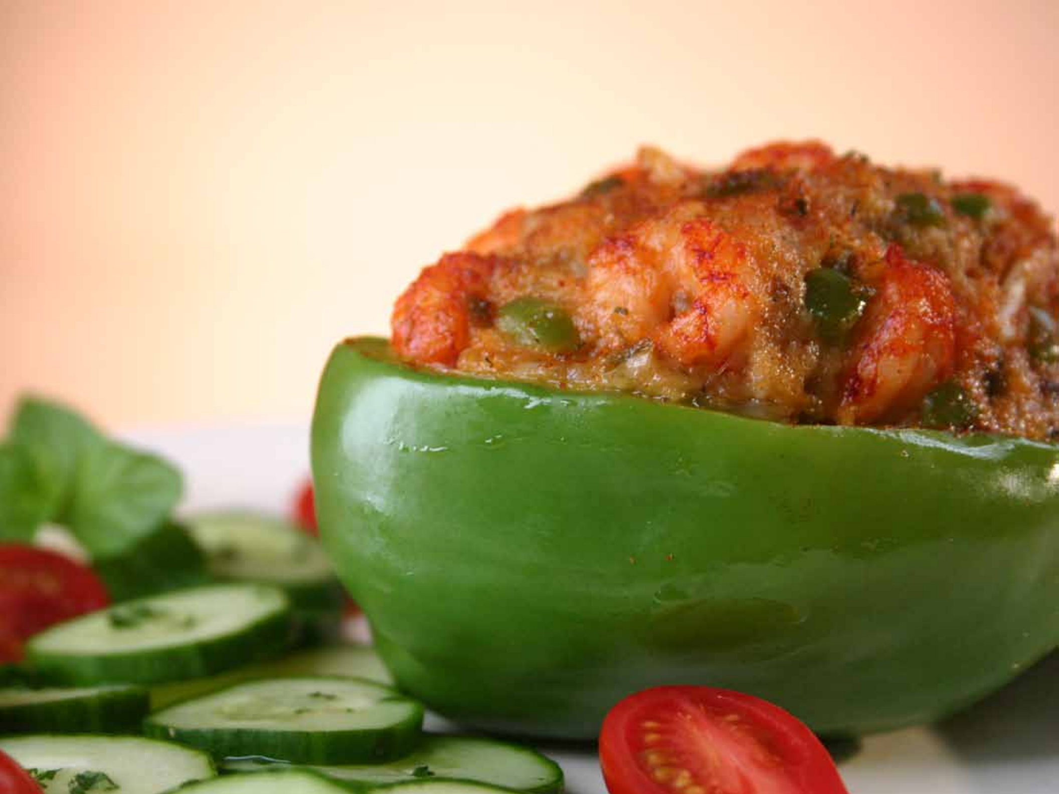
Our Stuffed Bell Peppers ... stuffed with your choice of delectable stuffings.