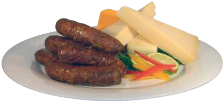
Four Cheese Sausage #14005