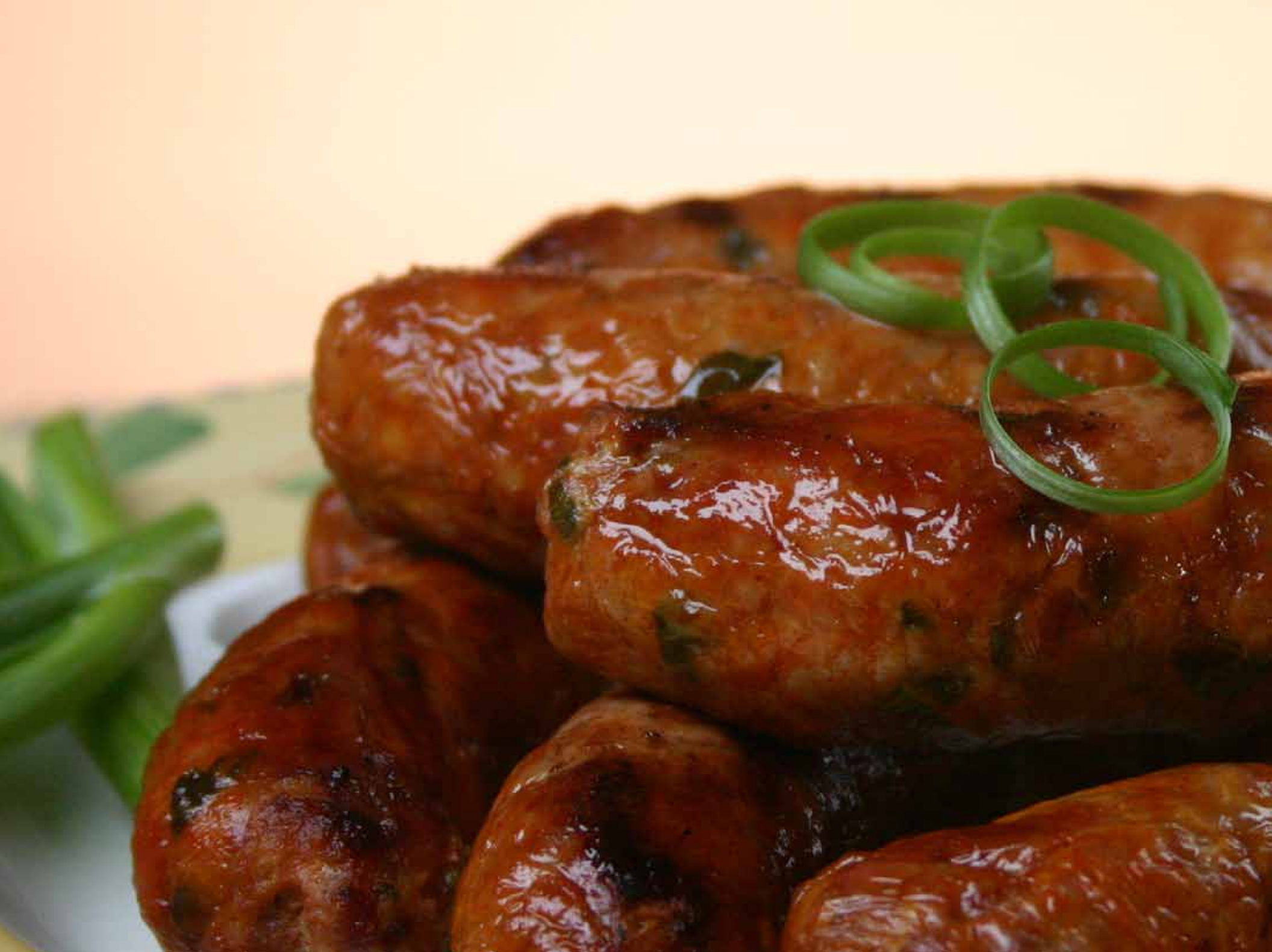
Our Famous Green Onion Sausage #14000