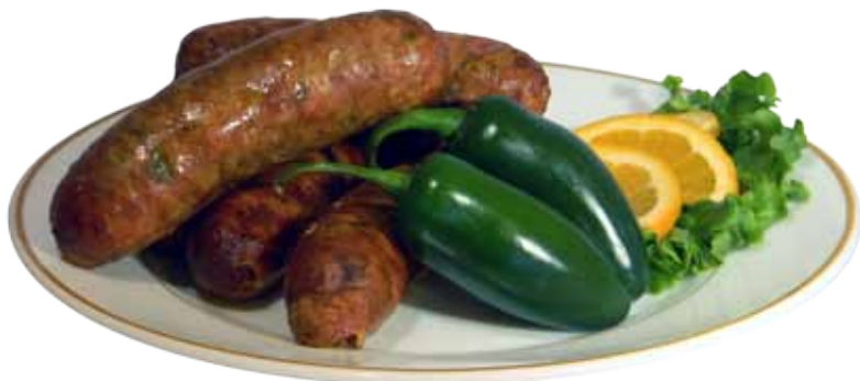
Jalapeño Pork Sausage: #14015