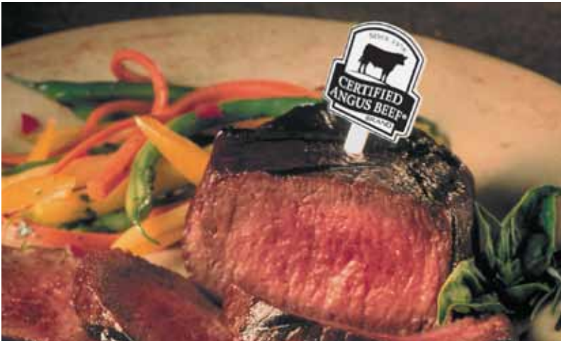
Top Sirloin Steak