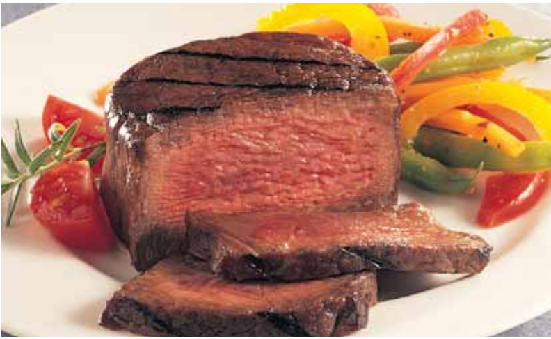
Filet Mignon Steak