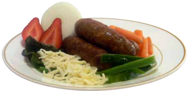
Philly Cheese Steak Sausage #14025